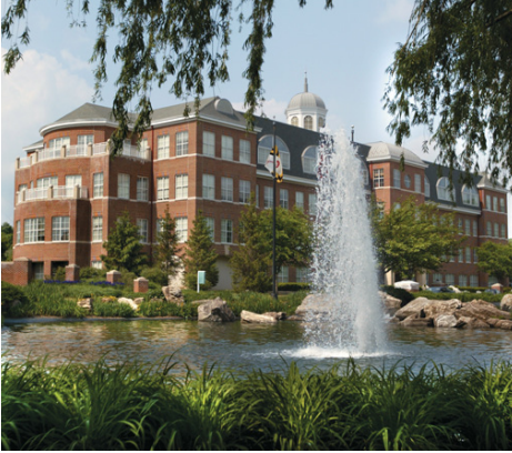
Johns Hopkins Green Spring Station